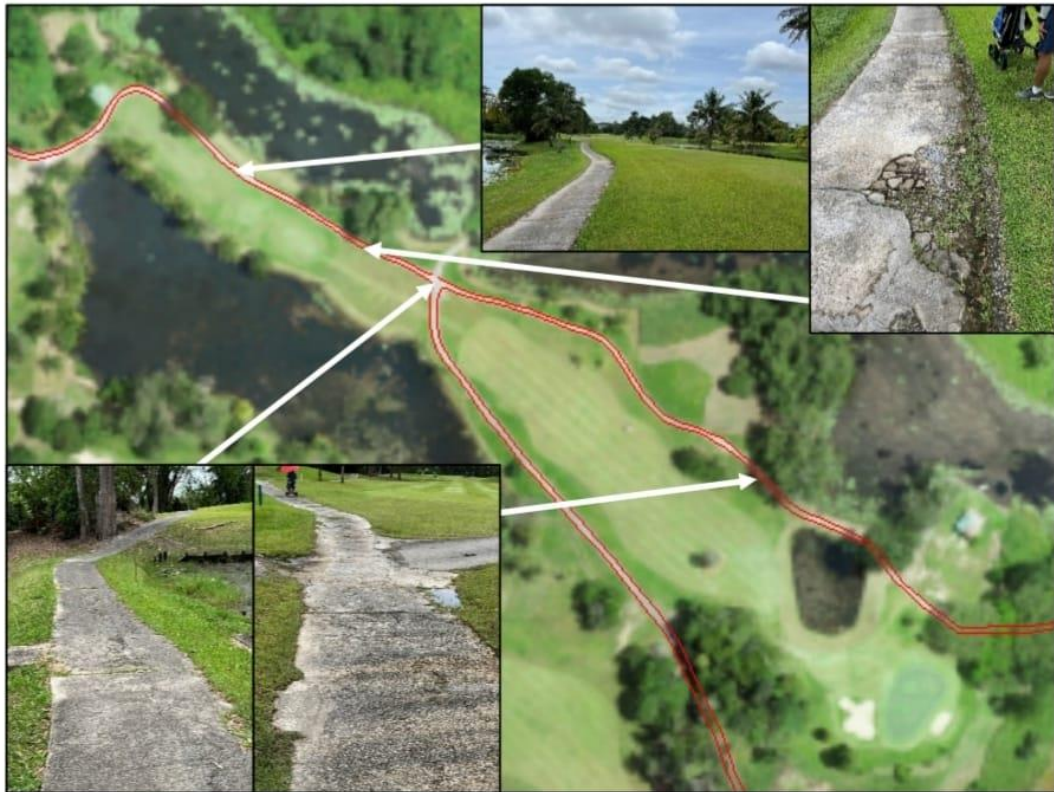
Plate 3 – Siol Hole 3

Existing buggy tracks along Siol Hole 3 consists of concrete pavement. There are cracks and surface worn off on the existing concrete pavement. Plate 3 depicts the existing buggy track condition: